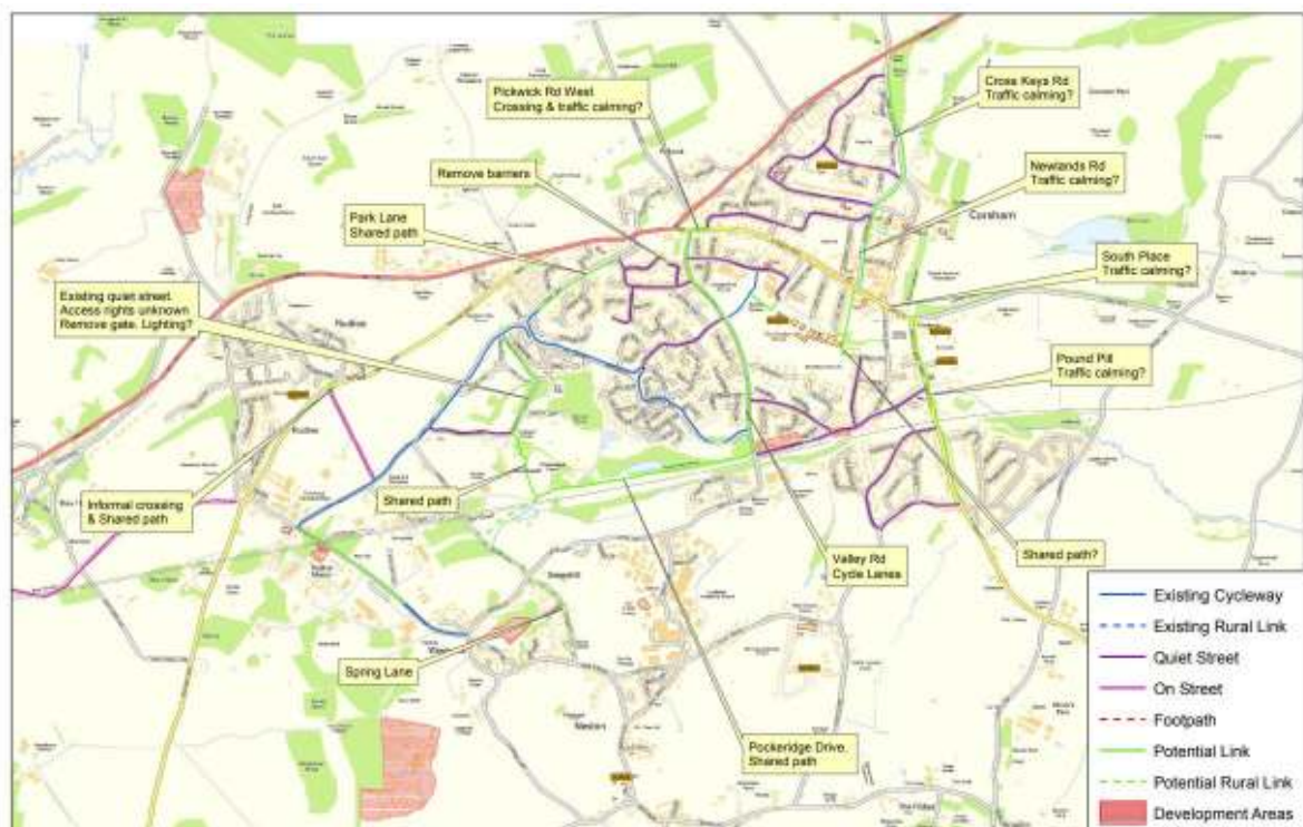
Corsham Town Cycle Network

The Corsham Town Cycle Network Map includes planned and aspirational cycle routes, available on Wiltshire Council's website ( http://www.wiltshire.gov.uk/transport-town-cycle-networks ).